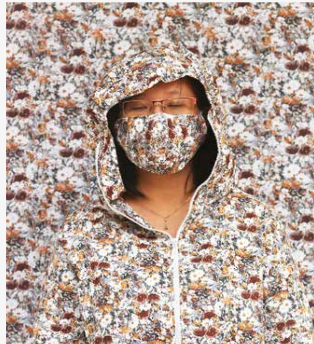
— Paris (Street Flower Series) by Ailbhe Greaney

A work of art can be a wonderful stimulus in the classroom and is a natural starting point where young people can observe closely, think critically and translate their thoughts and reactions into words.