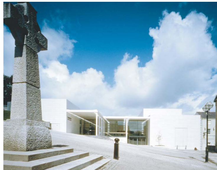
Market Place Theatre and Arts Centre, Armagh Front Cover - Waterfront Hall, Belfast